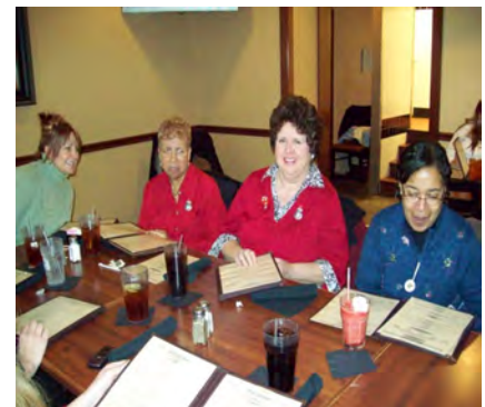
LMHA Holiday Party at Chester's