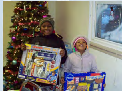
Children with their gifts in front of the Holiday tree